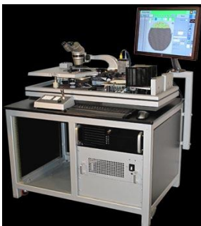
Die Probe Station