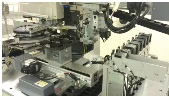
Automated Pick and Place