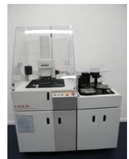
Automated Optical Inspection